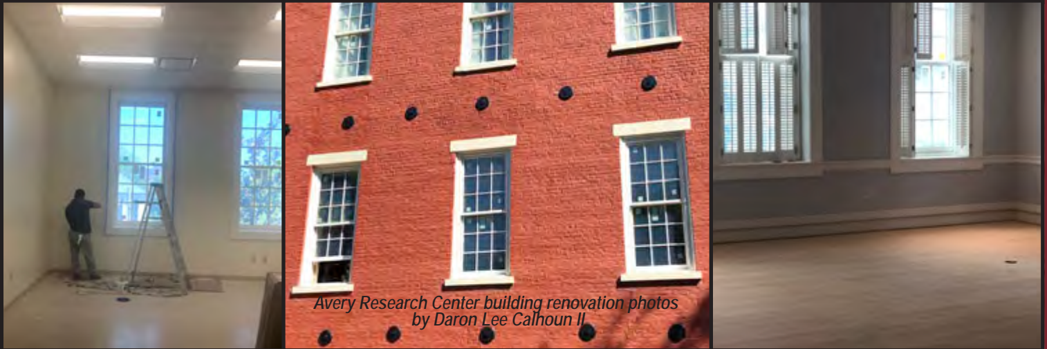
Avery Research Center building renovation